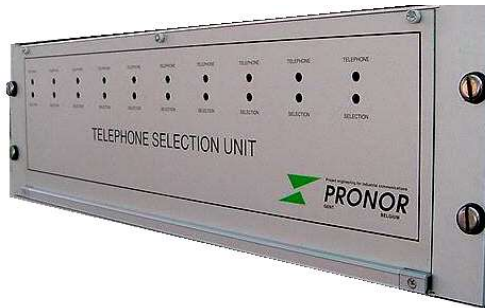
Model TELPA-DIG/RA 19" rack (Max. 10 TELPA-DIG cards)